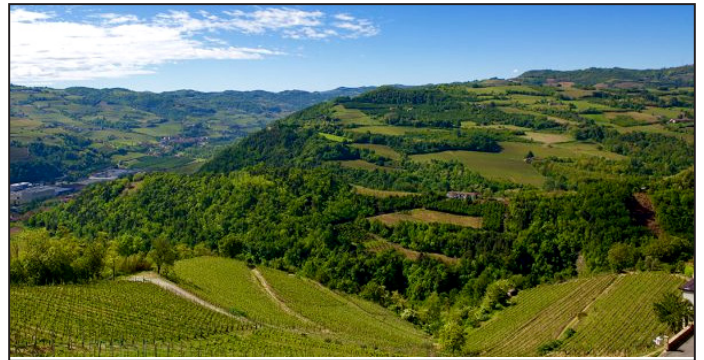
Azienda Agricola 499

Freisa is the sole red grape of Azienda Agricola 499, a pioneering organic vineyard project. It originated in the hills between Asti and Turin, according to ampelographers, in the 18th Century. Its high acidity, firm tannins, ageability, and complexity can be credited to its genetic connection to Nebbiolo.